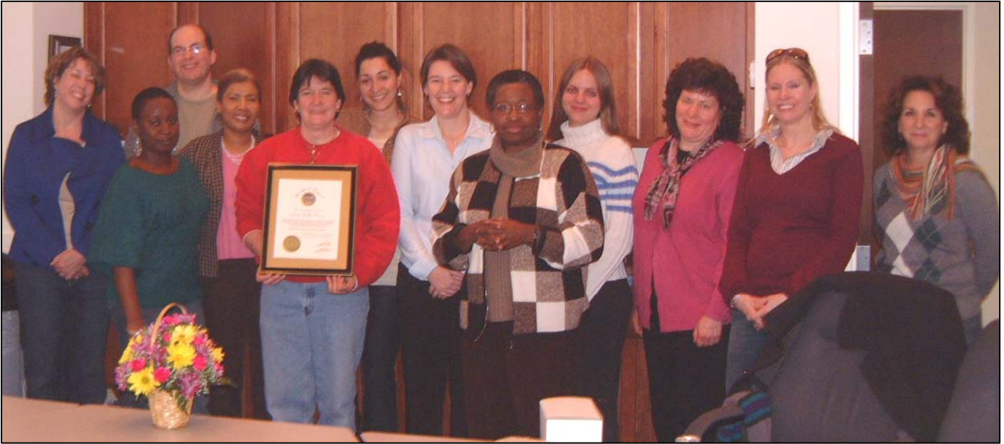
Staff of GUIDE Youth Services are pictured with the Governor's Volunteer Service Award, presented to GUIDE on November 6, 2008 at the City of Gaithersburg Capital Day Luncheon.