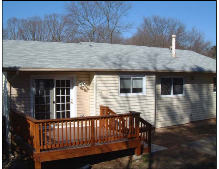
BEFORE AND AFTER: GUIDE's HUD sponsored renovation of the Nashville Hill House group home approached completion in late 2008.