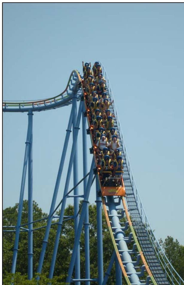
Youth from GUIDE's Therapeutic Group Home enjoy a wild roller coaster ride on an outing to King's Dominion.